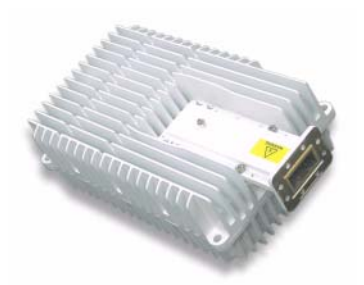
C-Band DC-powered BUC

The BUCs are completely protected from the elements, are without external user controls and are fully sealed, and pressure tested to 34 kPa (5 psi). Particle and moisture penetration is rated to IP67. High quality paint is used to protect the modules from corrosion.