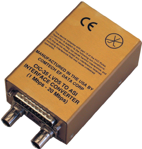
CIC-35 LVDS to ASI Interface Converter

While the CDM-600/600L modem is capable of data rates up to 20 Mbps, its standard interface is limited to RS-422, V.35 and RS-232 and LVDS formats only. In order to accommodate the ASI format, a small converter box is available which attaches to the rear of the modem at the 25-pin data connector. No external power is required.