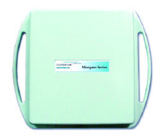
TeraMax Ruggedized Enclosure (EX)