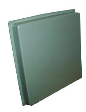
TeraMax Flat Panel Enclosure (FP)